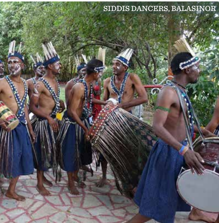
SIDDIS DANCERS, BALASINOR

classic brands such as Louis Vuitton, Dior, Montblanc, as well as ultra-luxury brand Stefano Ricci, who opened this boutique in person in 2015, with Guest of Honour philanthropist Ratan Tata and Bollywood superstar Sridevi.